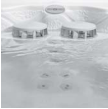
Water level should be two-thirds up the Vortex skimmer opening.