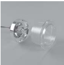
Remove lamp socket from back of light assembly.