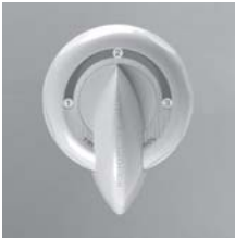
Tri-Zone control must be “open” to the jets you are vacuuming, in this case, the upper and mid back jets.

NOTE: Direct sunlight on the spa surface can cause severe damage or blemishing and can result in the voiding of any surface warranties.