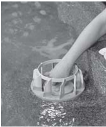
Turn filter cartridge counterclockwise to unscrew.

Use a hose to clean the filter cartridge and Filter Cleaner to soak the filters (you will need to flip the filter after the designated time to completely clean the entire length).